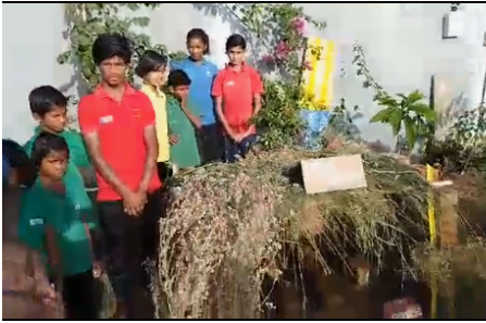
JUGAAD BEST OUT OF WASTE