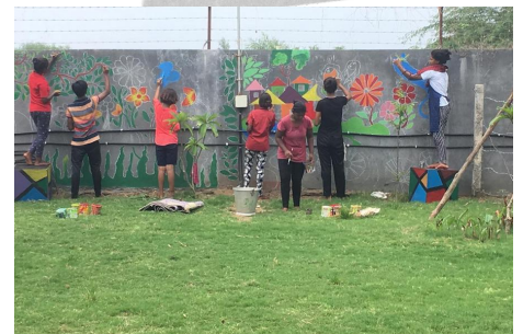
WALL PAINTING June 20