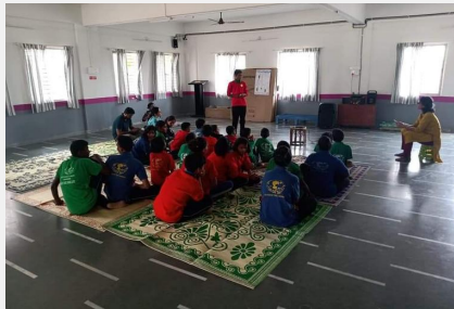
EXTEMPORE June 24