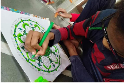
MANDALA June 6