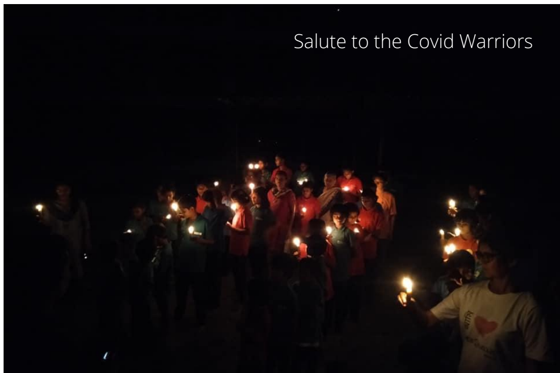
Salute to the Covid Warriors