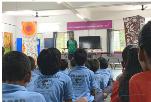
GUJARATI STORY TELLING COMPETITION