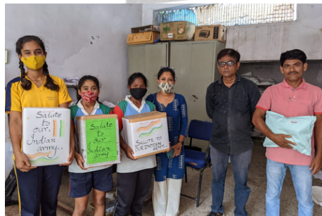
SENDING RAKHIS MADE BY CHILDREN TO OUR TROOPS ON THE BORDER