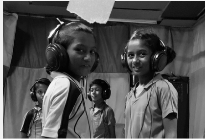
STUDIO RECORDING FOR SEP 29, FOUNDATION DAY EVENT