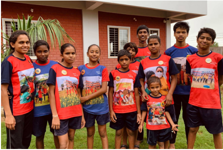
WORKER'S OF THE WEEK AWARD