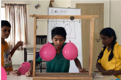
VELOCITY & PRESSURE