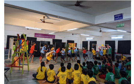
CLUB ACTIVITIES PERFORMANCE