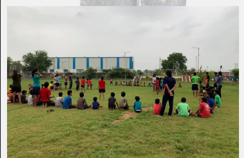
SUNDAY FUNDAY - SATODIYU