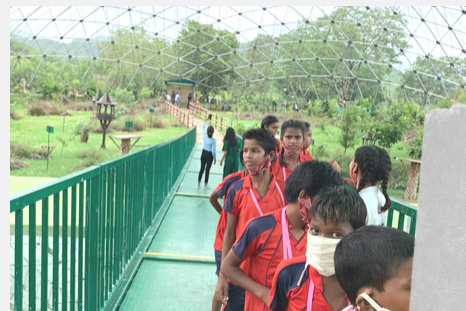
STATUE OF UNITY VISIT