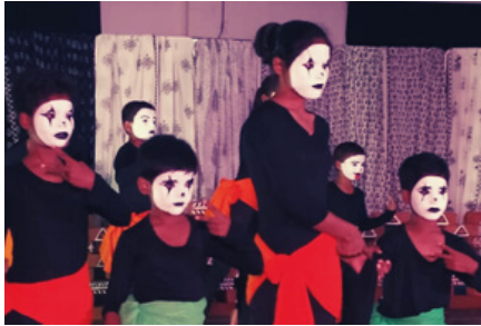
INTERHOUSE STAGE PRESENTATION