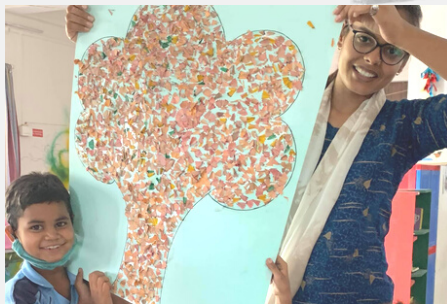
CLASS 1 MAGICAL TREE