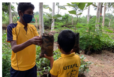
HOUSE REWARD - NURSERY VISIT