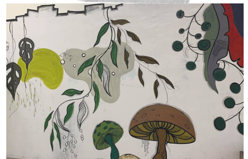
INDOOR WALL PAINTING