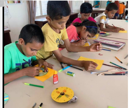
SKILL DEVELOPMENT CENTER - CLOCK