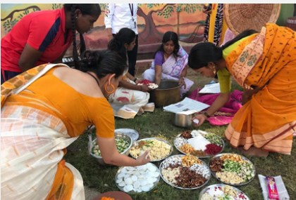
NABANNO - HARVEST FESTIVAL CELEBRATION