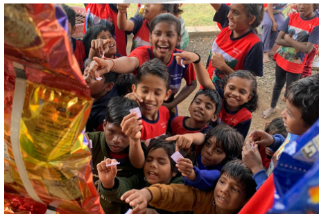
CUTTING CHAI - RESTARTED