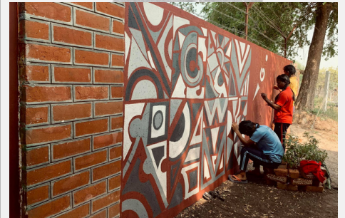
WALL PAINTING - AFRICAN TRIBAL ART INSPIRATION