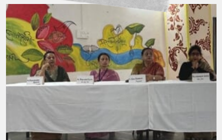
ANNUAL GENERAL BODY MEETING