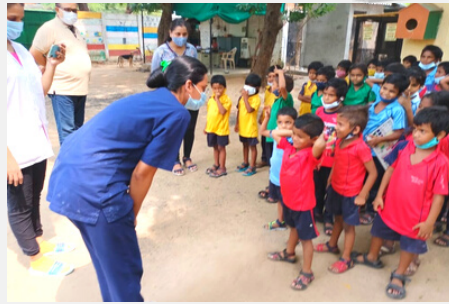
PROJECT ANIMAL - ANIMAL SHELTER VISIT