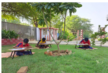
FIRST TERM EXAMS