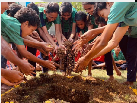
PATHSHALA CLASSROOM BHOOMI POOJAN