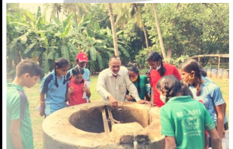
MUNI SEVASHRAM VISIT