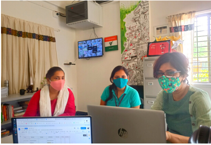
SHIFTING TO INQUIRY BASED LEARNING