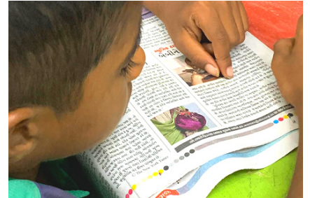
CHALO PADTE HAI - DEDICATED READING TIME