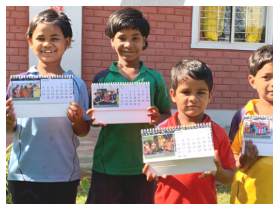
CALENDARS AVAILABLE FOR SALE