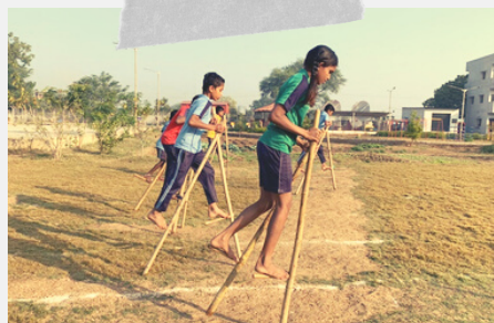
SPORTS DAY PREPARATION