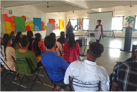
PROJECT BASED LEARNING: TEACHER'S WORKSHOP