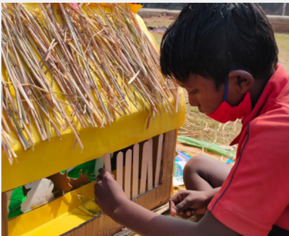
GROUP PROJECT - PROJECT FASAL