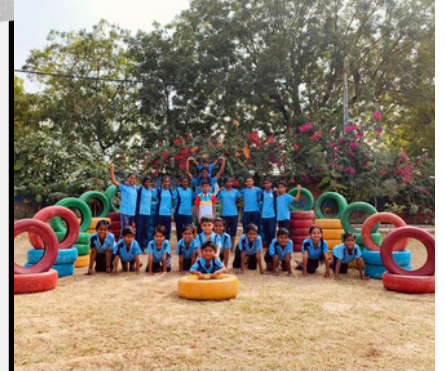
TYRE DECORATION COMPETITION