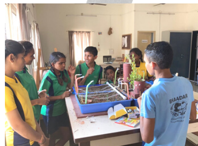
UDHAM MODEL MAKING IN PROGRESS