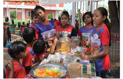
CHAI PE ADDA