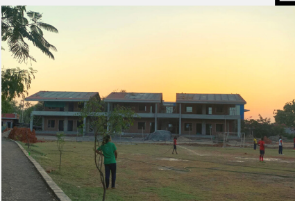
PATHSHALA CLASSROOMS CONSTRUCTION PROJECT