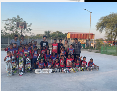
SKATEBOARDING CLASSES ON CAMPUS