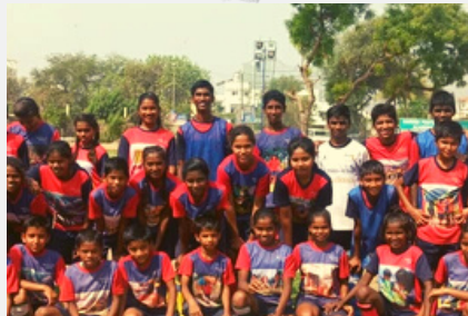
FOOTBALL COACHING AT BFA, GOTRI, VADODARA