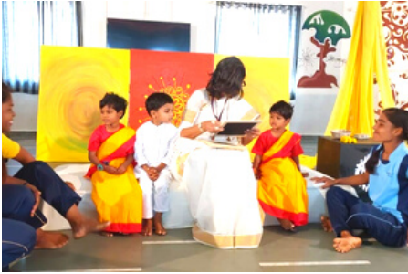
HAATE KHORI - FIRST WRITING CEREMONY FOR THE LITTLEST ONES