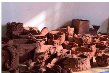
CHILDREN'S POTTERY FOR ART CART