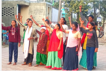
STREET PLAY ON FASAL