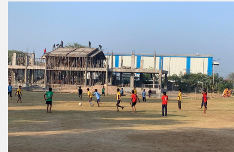
FOOTBALL COACHING ON CAMPUS