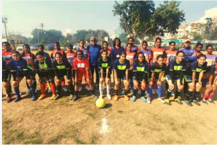
GIRLS & BOYS FOOTBALL TOURNAMENT- BFA VADODARA