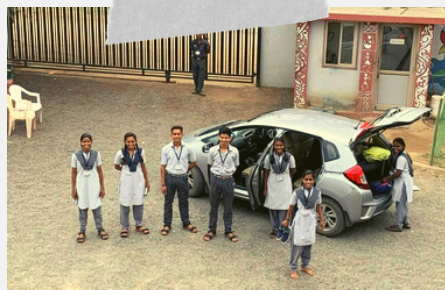
CLASS X & XII NIOS EXAMS