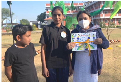
BOOK RELEASE - REPUBLIC DAY