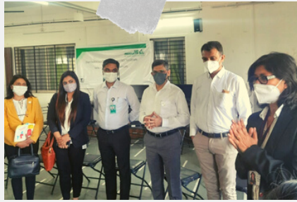
AIR PRODUCTS - DESKTOP DONATION/ INAUGURATION