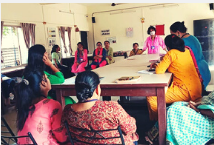
TEACHERS' MEETING FOR VISION & MISSION SETTING