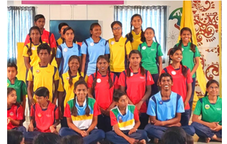
ELECTED STUDENT COUNCIL INSTATED