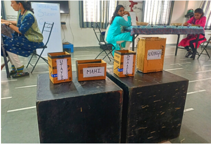
ELECTIONS FOR STUDENT COUNCIL