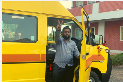
NEW BUS FOR PATHSHALA HOSTEL