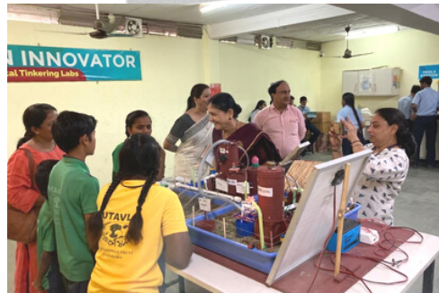
SUSTAINABILITY MODEL PRESENTATION IN NEW ERA SENIOR SECONDARY SCHOOL