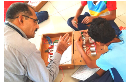
ELECTRICAL WORKSHOP BY KOSHISH MILAP TRUST