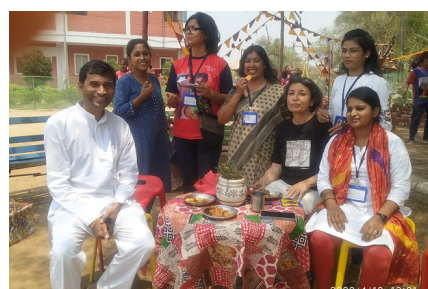
SUNDAY TEA STALL