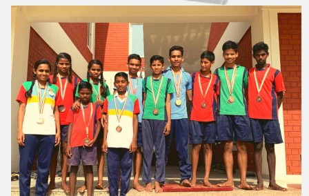
KHEL SPARDHA WINNERS