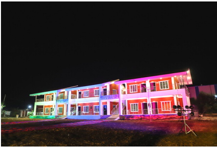
MAY 9 - CLASSROOM INAUGURATION