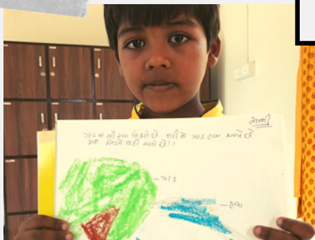
PROJECT RIVER (PBL) - HANDS ON LEARNING