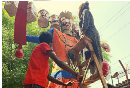
RAVANA SCULPTURE MADE USING SCRAP IN AND AROUND CAMPUS