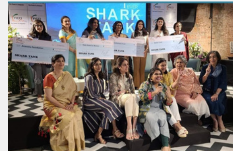
FICCI FLO SHARK TANK. WON FUNDING FOR CLASSROOM FURNITURE