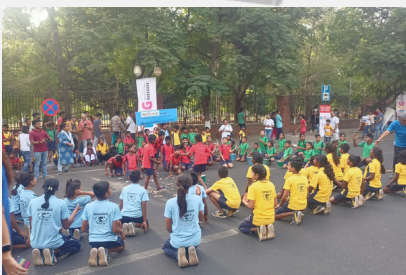
STREET PLAY ON POLLUTION & CLIMATE CHANGE PERFORMED IN HAPPY STREET EVENT