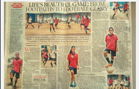
PRESS COVERAGE FOR GIRLS' FOOTBALL TEAM ACHIEVEMENTS