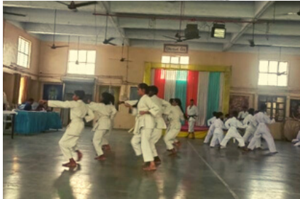
KARATE - FIRST ASSESSMENT