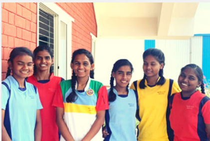
RESULTS: GIRLS TO GRADUATE CLASS 12 BY MARCH 2023