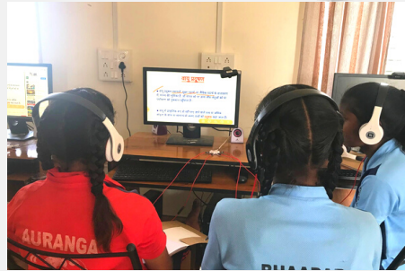
RESEARCH ON WIND POLLUTION