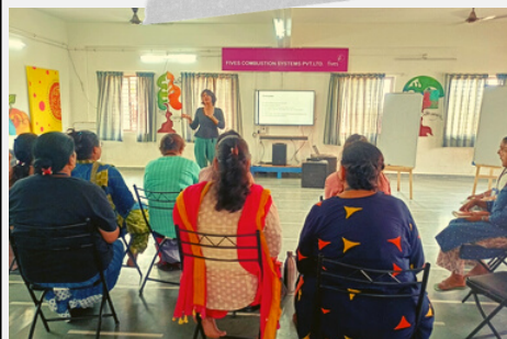
WORKSHOP FOR TEACHERS