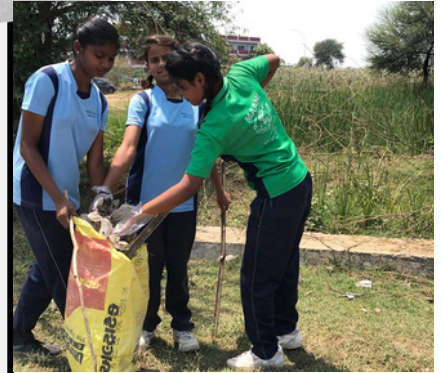
GARBAGE COLLECTION IN LASUNDRA