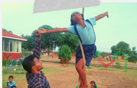
MALKHAMB, KHOKHO, KABADDI, ATHLETICS INTRODUCED ON CAMPUS