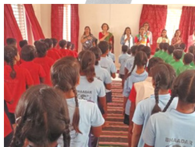
ASSEMBLY AT NEW CLASSROOM BUILDING