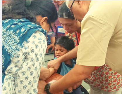
VACCINE DRIVE AT HOSTEL