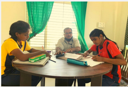
CLASSROOMS FOR SENIOR CHILDREN