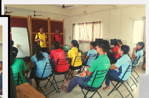
LIFELINE FOUNDATION PUBLIC SPEAKING WORKSHOP