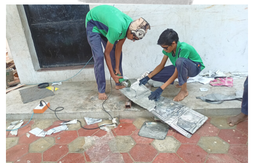
MODEL MAKING (POLLUTION & CLIMATE CONTROL)