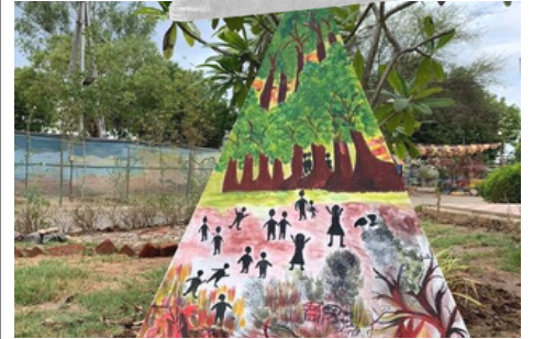
CANVAS PAINTING COMPETITION (ENVIRONMENT DAY)