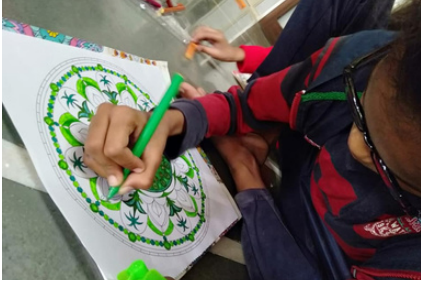
MANDALA June 6