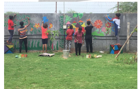
WALL PAINTING June 20