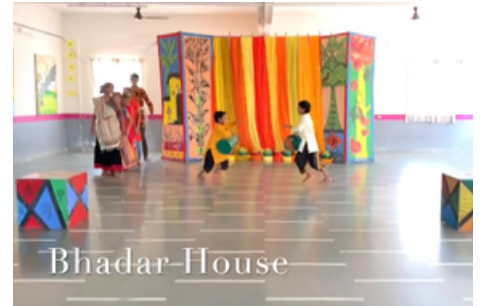
GROUP DANCE June 15