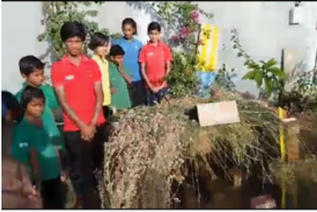
JUGAAD BEST OUT OF WASTE