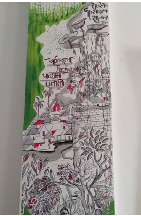
Salute to the Covid Warriors