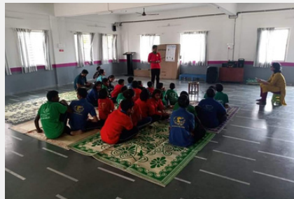
EXTEMPORE June 24