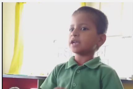
STORY TELLING june 21