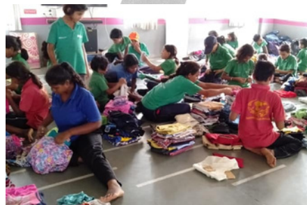
ARRANGE CLOTHES AND SEGREGATE BY CATEGORY June 8