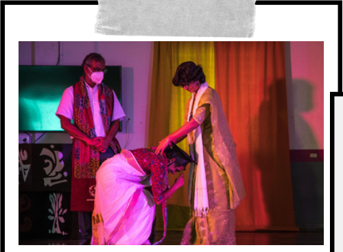
FIRST BLESSING CEREMONY FOR CLASS 10