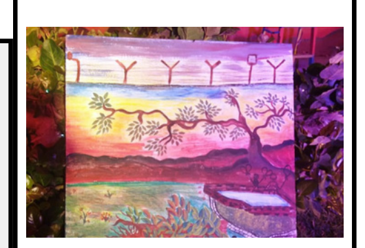
WALL MAGAZINE COMPETITION