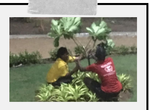
SAVING TREES DURING STORM