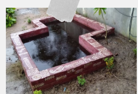
FISH POND CONSTRUCTED BY THE CHILDREN