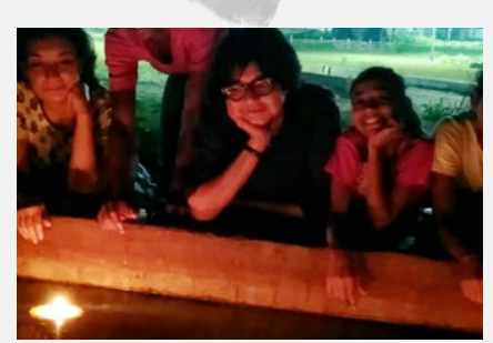
FIRST BIRTHDAY CELEBRATIONS