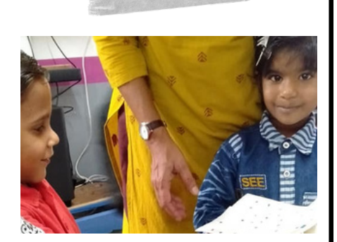
CHILDREN'S BIRTHDAY CELEBRATION