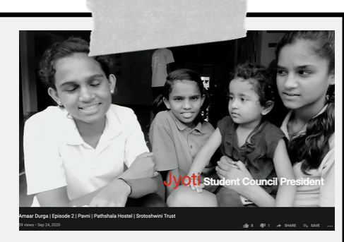
YOUTUBE CHANNEL THAT FEATURES OUR CHILDREN'S STORIES. OUR CURRENT SERIES IS - AMAAR DURGA CLICK HERE