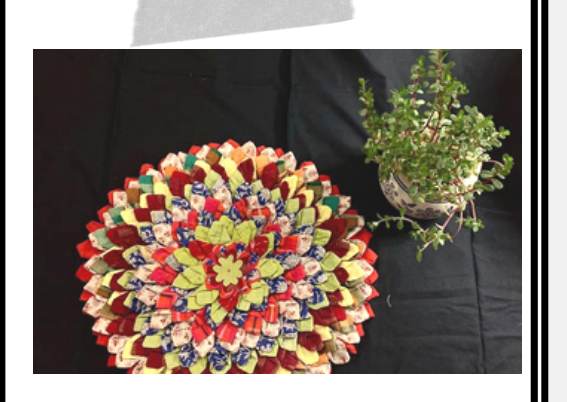
BEST OUT OF WASTE Doormat making competition