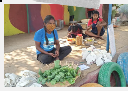
CUTTING CHAI & ORGANIC VEGETABLE SELLING