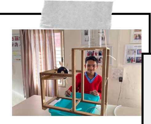
SKILL DEVELOPMENT CENTER