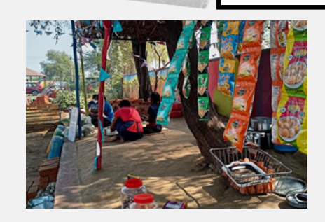
CUTTING CHAI Tea Stall