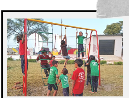
NEW PLAY GYM EQUIPMENT