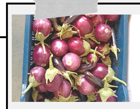
ORGANIC PRODUCE Pathshala Hostel Farm