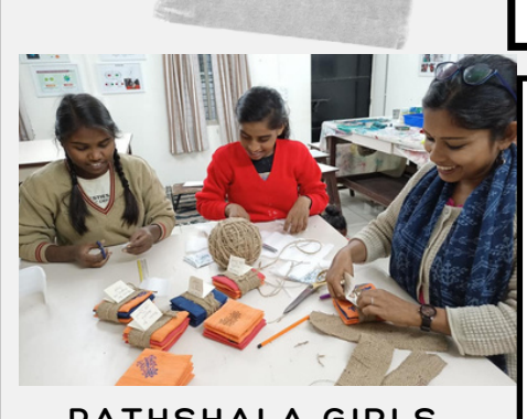
PATHSHALA GIRLS PARTICIPATING IN CHURNI PRODUCT MAKING