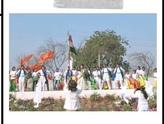
DANCE PERFORMANCE Republic Day Celebrations