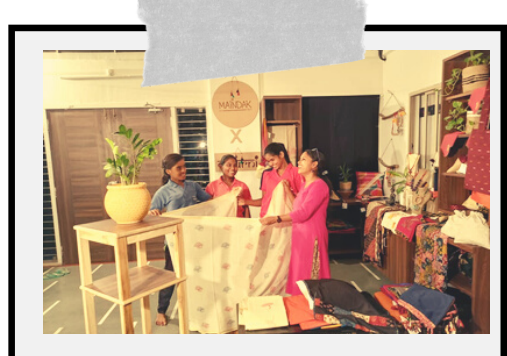
FIRST VIRTUAL EXHIBITION OF PRODUCTS MADE BY OUR GIRLS