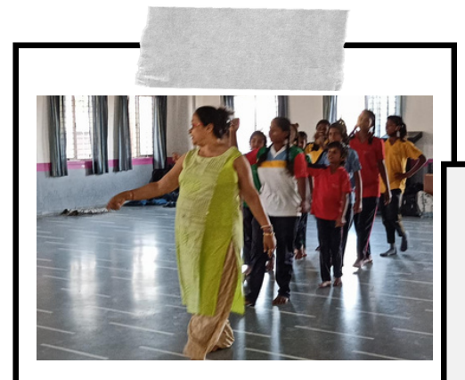
DANCE CLASS Biweekly Club Activity