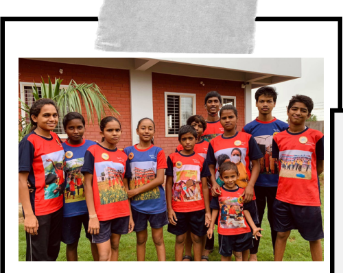
WORKER'S OF THE WEEK AWARD