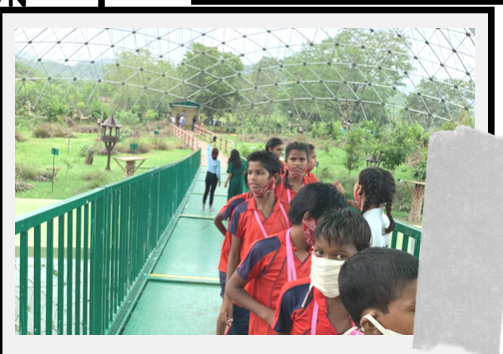
STATUE OF UNITY VISIT