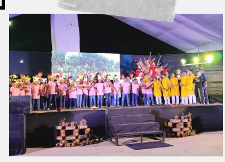
HOSTEL FOUNDATION EVENT