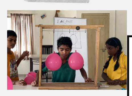
VELOCITY & PRESSURE