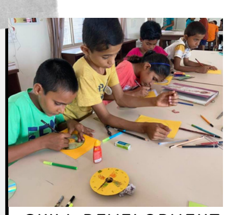
SKILL DEVELOPMENT CENTER - CLOCK