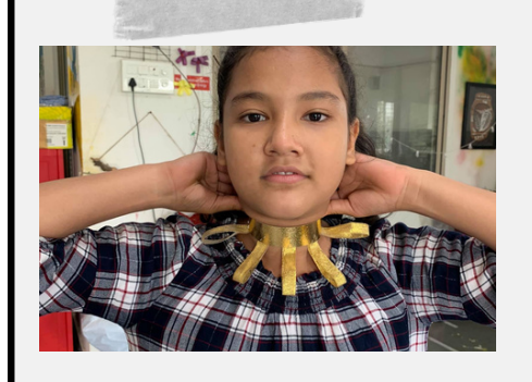
JEWELLERY MAKING FOR FOUNDATION DAY EVENT