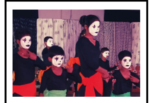
INTERHOUSE STAGE PRESENTATION