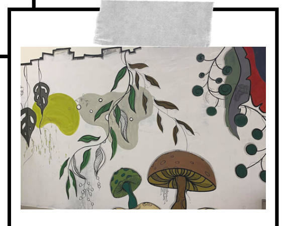
INDOOR WALL PAINTING