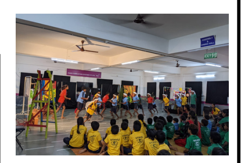
CLUB ACTIVITIES PERFORMANCE