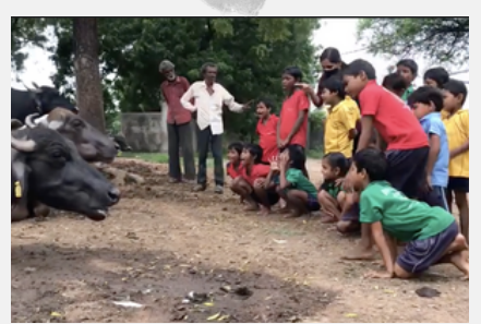
PROJECT BASED LEARNING FOR CLASS I