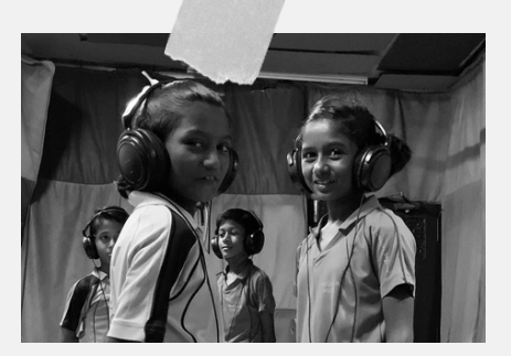
STUDIO RECORDING FOR SEP 29, FOUNDATION DAY EVENT