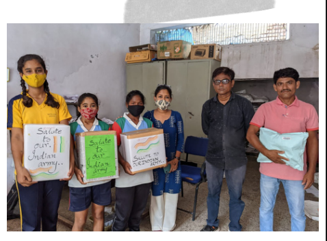
SENDING RAKHIS MADE BY CHILDREN TO OUR TROOPS ON THE BORDER