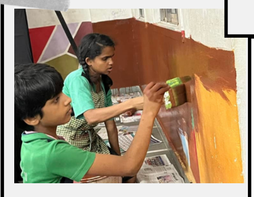
SEPTEMBER 29 VENUE DECORATION