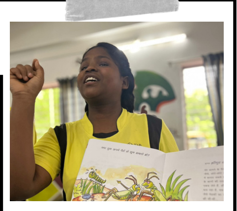
BOOK REVIEW SESSION POST ASSEMBLY