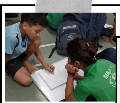
EVENING STUDY TIME