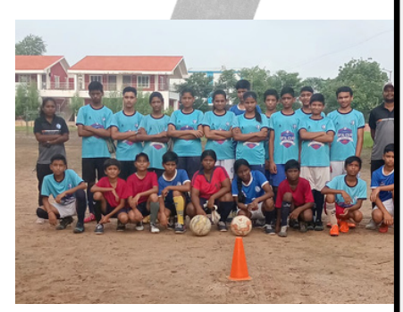
JUNIOR & SENIOR FOOTBALL TEAMS