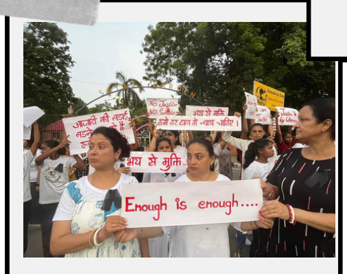
SILENT RALLY - JUSTICE IN RG KAR CASE