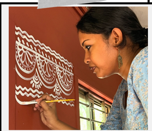
ALPONA IN KITCHEN