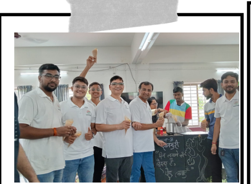
UNNATI TEAM SELLING PANIPURI, JHALMURI ETC. TO THE WORLEY TEAM