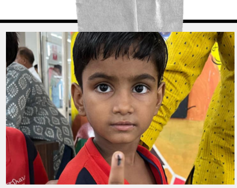
STUDENT COUNCIL 24 ELECTION WHERE ALL STUDENTS, STAFF & TEACHERS VOTED