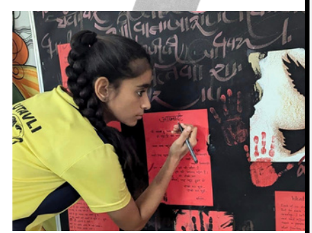
UPKATHA WALL MAGAZINE RELEASE