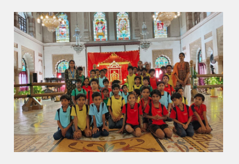
VADODARA PALACE VISIT FOR PBL