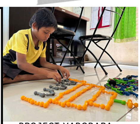
PROJECT VADODARA -CREATING THE GATES OF BARODA