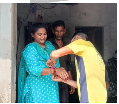
CHILDREN TYING RAKHI ON LASUNDRA VILLAGERS