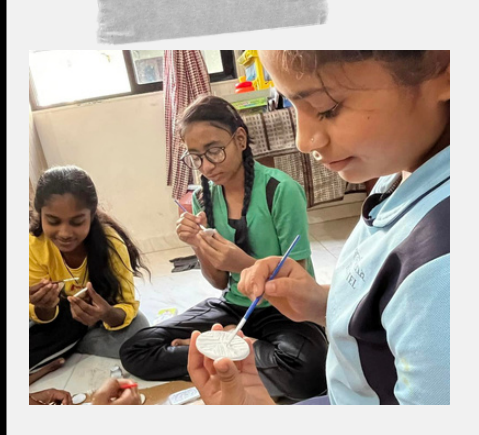
UDYAM - CLAY PENDANT MAKING