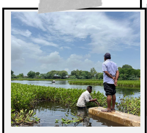
POND CLEANING INITIATIVE BY VILLAGERS